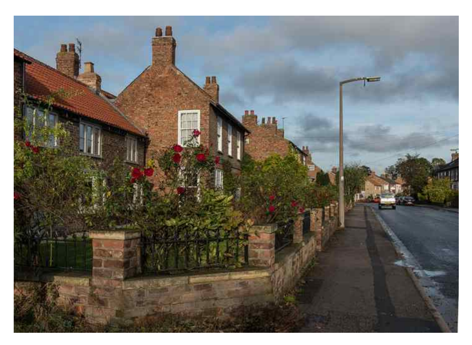
The Village, Strensall