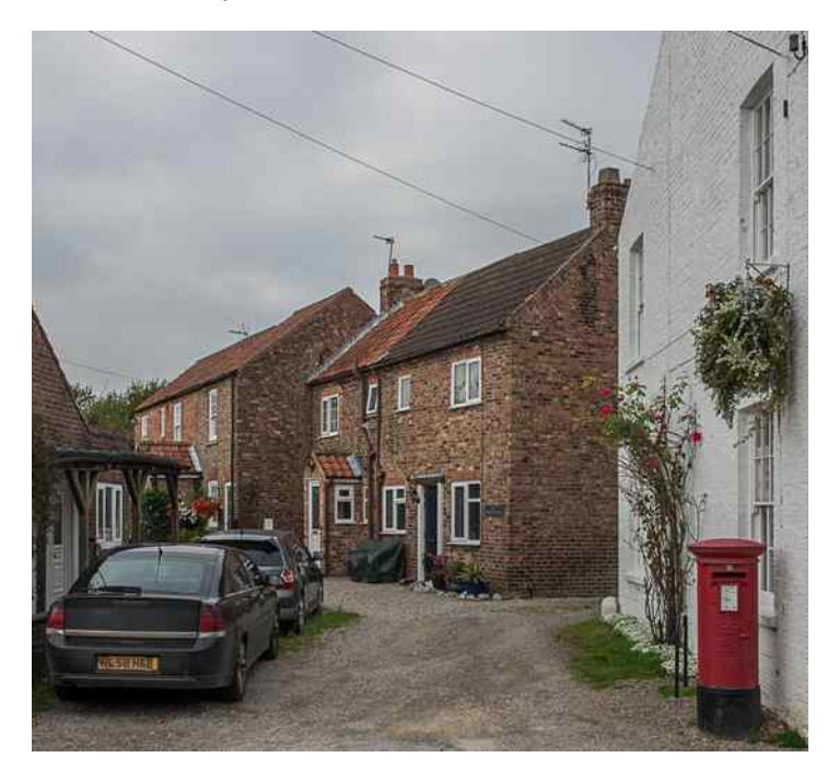
An old driveway in the centre of the Village

Strensall began with a typical medieval pattern of properties, with narrow-fronted plots of land that extend back on either side of a single West-East Street (the present Church Lane and The Village). The plots on the north side were bounded by the River Foss and those on the south side stretched to Back Lane (now Southfields Road).