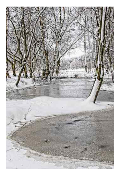
Winter ponds on Strensall Common