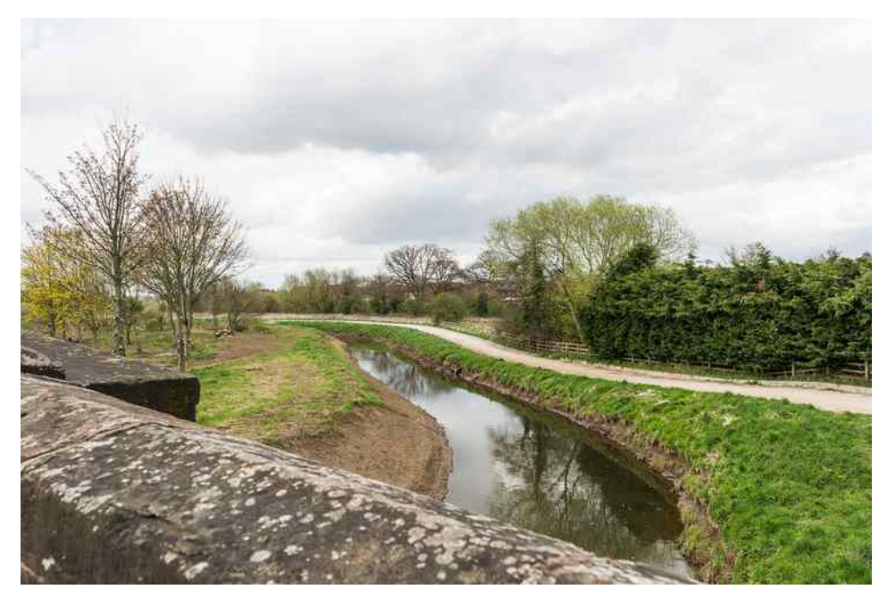
Footpath running North East along the River Foss from Strensall Bridge

All these paths combine to provide a good, free to use, recreational facility. This benefits the overall health and well being of Villagers and provides an opportunity to see the varied wildlife within the Parish.