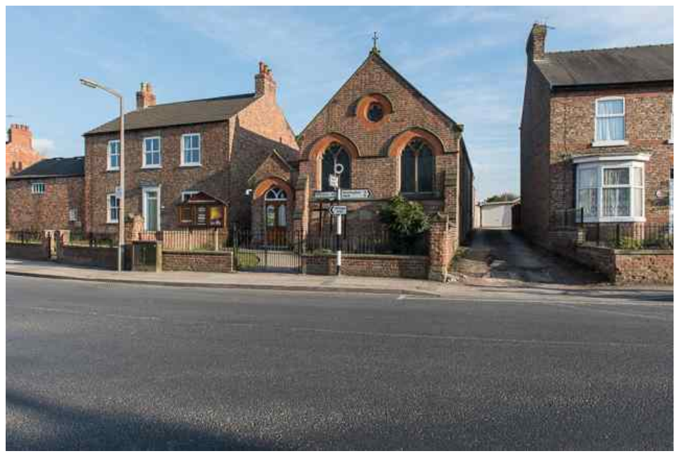
Strensall Methodist Church

The first Methodist Chapel in the Village was St Mary's Hall in Church Lane. It was built in 1879, the porch being added in 1895, but the building was too small for the Methodist community's needs. It then became a dwelling house until 1983 and it has now fallen into disrepair. The new Methodist Church was built on The Village in 1895, on the site of the "Village Pinfold", a holding pen for stray animals. The Church was built on a scale better to serve the expanding Methodist community. The Villagers still use the expression "the Methodist Chapel" for this Church.