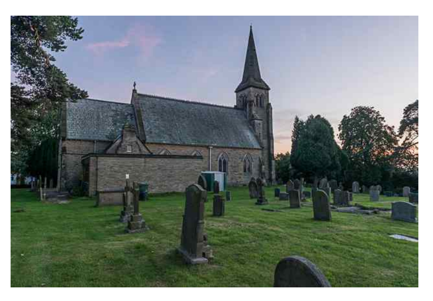
Church of St Mary the Virgin.

There are three places of worship in the Village, the Church of St Mary the Virgin, the Methodist Church and the Garrison Church.