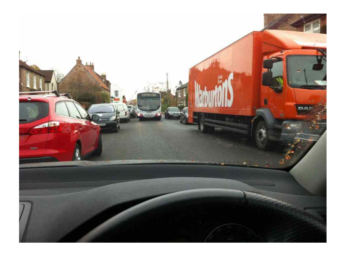
The First Bus Service in the Village centre during shopping time

The First Bus service is valued and much used within the Village. It is, however, not easily accessible from many parts of the Village. In addition, it contributes and is subject to the traffic congestion in the centre of the Village.