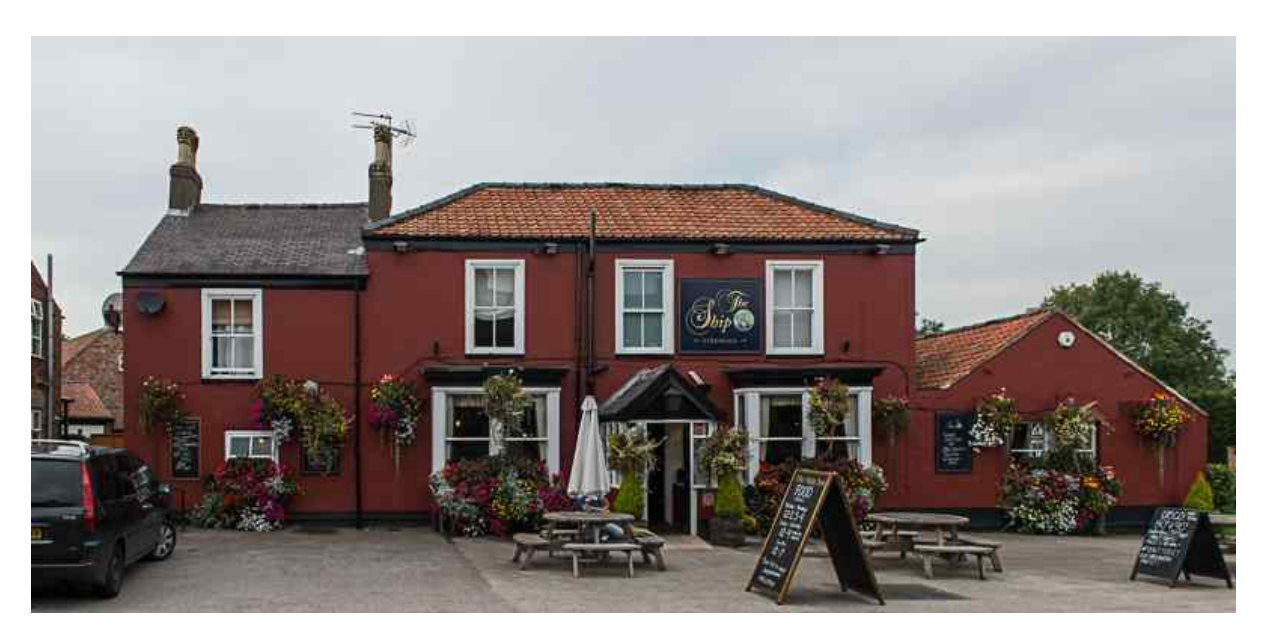
The Ship Public House

Some of the buildings within Strensall have rendered or painted facades, for example The Ship Public House. Although the use of render and painted brickwork is not the predominant material for external walls within the area, these buildings also contribute to the character and appearance of the area.