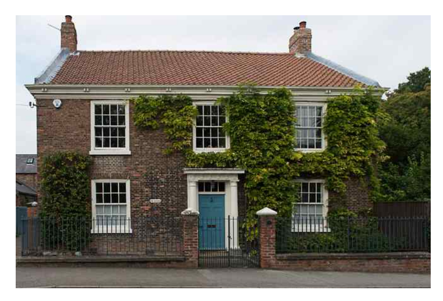
The Grange, Strensall

The eastern section of The Village appears quite intimate as the street curves and undulates gently, with subtle variations in carriageway width and some buildings huddling closer to the street frontage. Trees and hedges add to the feeling of enclosure and 'protection'. The more traditional areas of the village demonstrate a sense of continuity of character.