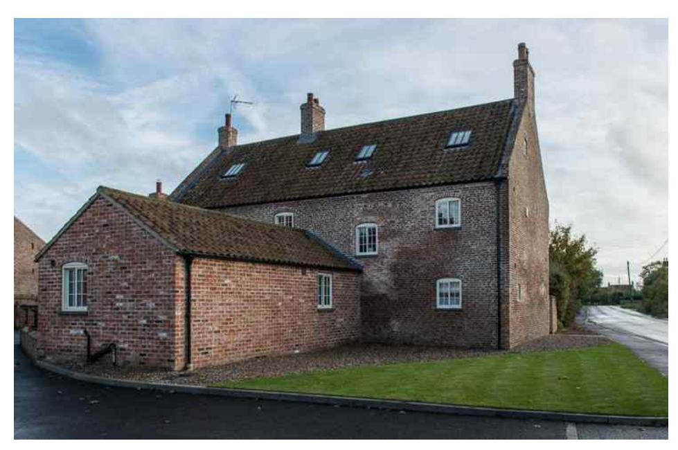
Low Farm Farmhouse Towthorpe

The Towthorpe Conservation Area was designated in 2001. It includes Towthorpe Moat and also Low Farm Farmhouse, a Grade 2 listed building which retains the original internal doors and baluster staircase. Development which has taken place is sympathetic to the existing 19th Century or earlier brick buildings. Much of the Strensall Military Training Area including part of the Barracks is also located in Towthorpe, as is the Barley Rise development.