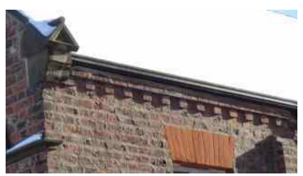
Decorative Banding and Brick Cambered Lintel

Most retain their original features, such as sash windows and cast iron downpipes. Also, within this character area are a number of larger or more prominent detached properties which reflect the expansion of the Village during the late nineteenth and early twentieth centuries.