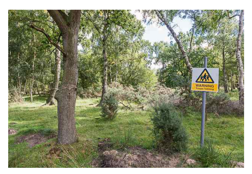
Strensall Military Training Area

The War Department purchased Strensall and Towthorpe Common in 1884. The lawful use of the Common is governed by three legal publications, Strensall Common Act 1884; Strensall Common Regulations and Strensall Common Bylaws, approved by Act of Parliament.