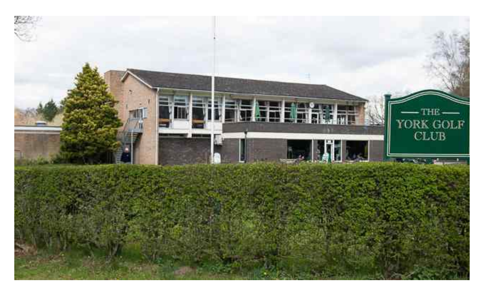
Clubhouse, the York Golf Club

The York Golf Club, the oldest golf club in the area, was established in 1890 as a members' club. The Club is a non-profit making organisation which reinvests all surplus income back into the Club. It is a Community Amateur Sports Club under the terms of the Finance Act 2002 and it provides sporting and related social facilities to the community. It prides itself on its Junior and Lady Golfer starter programmes. The course itself is a serene blend of parkland and heathland with a definite emphasis on natural beauty rather than artificial features. It measures 6290 yards (Men's Competition Tees) and the greens are acclaimed to be among the finest in North Yorkshire. The Club has invested heavily in improving the drainage of the course in recent years.