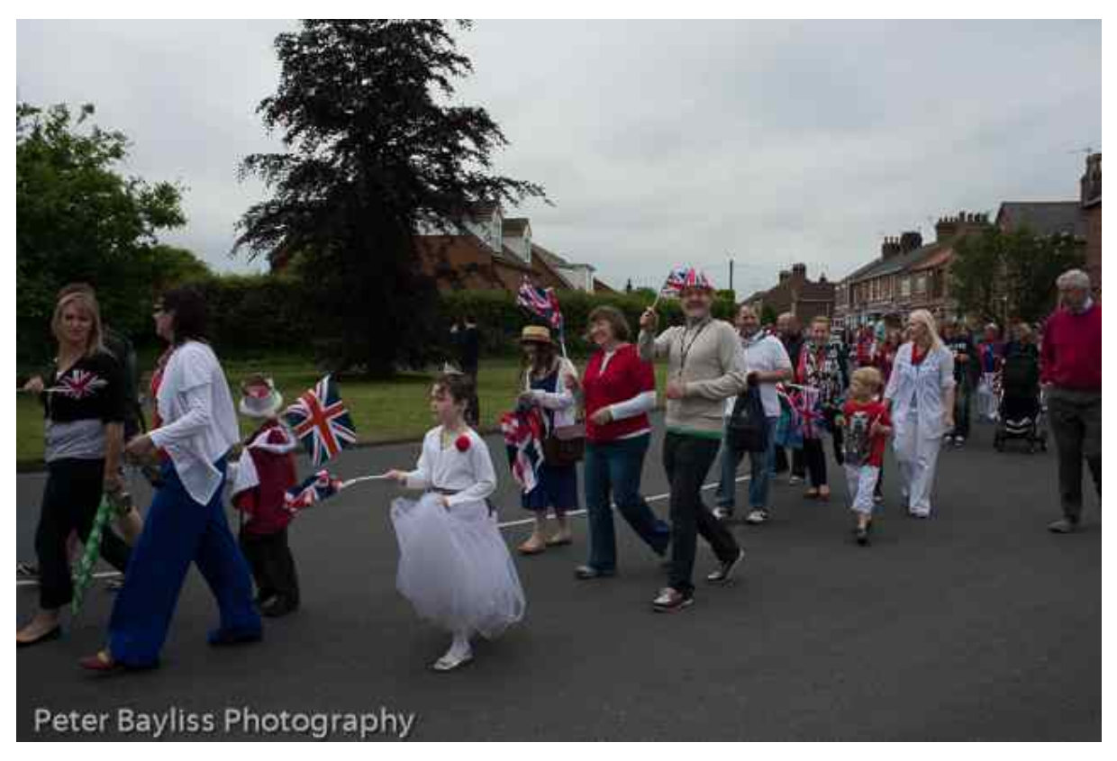
The start of the Diamond Jubilee Parade, West End, Strensall

The 6,500 people of the Village are characterised both by those whose families have been here for generations and the many who have moved here within the last thirty years.