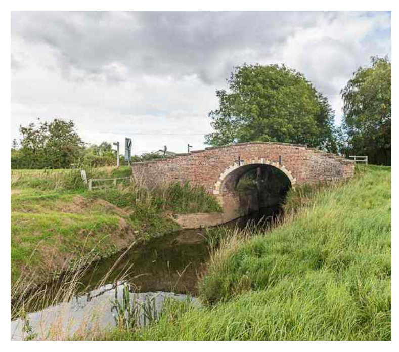
Strensall New Bridge - "Old Humpy"

During its working life, the canal carried important cargo of coal, lime, farm produce and building materials. In 1845 the York to Scarborough railway opened, taking most of the cargo and revenue from the canal and causing its closure. In a short walk along the River Foss you can still see the industrial archaeology left over from the canal, including lock walls, sluice gates, winding gear, and the historic Strensall New Bridge.