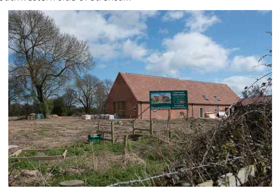
Towthorpe - The conversion of agricultural buildings

Towthorpe is a small hamlet which has survived as a peaceful cluster of 19th Century or earlier brick farmhouses and farm buildings set in the countryside on the southwestern side of Strensall.