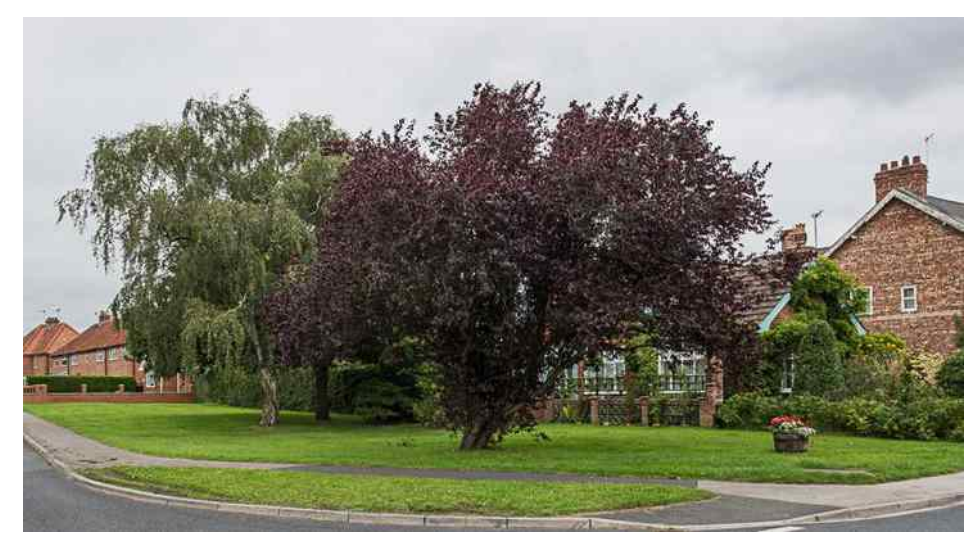
The entrance to Northfields

Most of the more modern buildings in this character area are constructed in a sympathetic brick and are of a simple form.