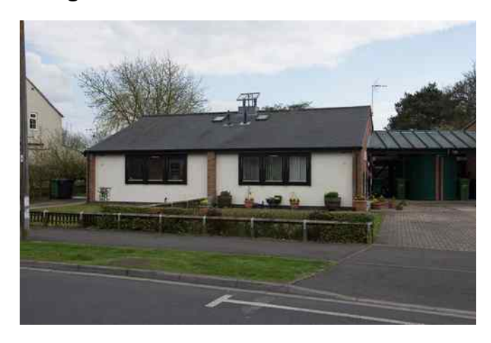
Sheltered Housing on Southfields Road

Most housing within Strensall with Towthorpe was built in the last quarter of the 20<sup>th</sup> Century and there are now some 2400 dwellings in the Village with a resident population of about 6500 people. Most of the modern developments were built in varying styles and types with relatively short roadways, often small cul-de-sacs. The properties vary in size from two bedroom semi-detached houses to large detached houses.