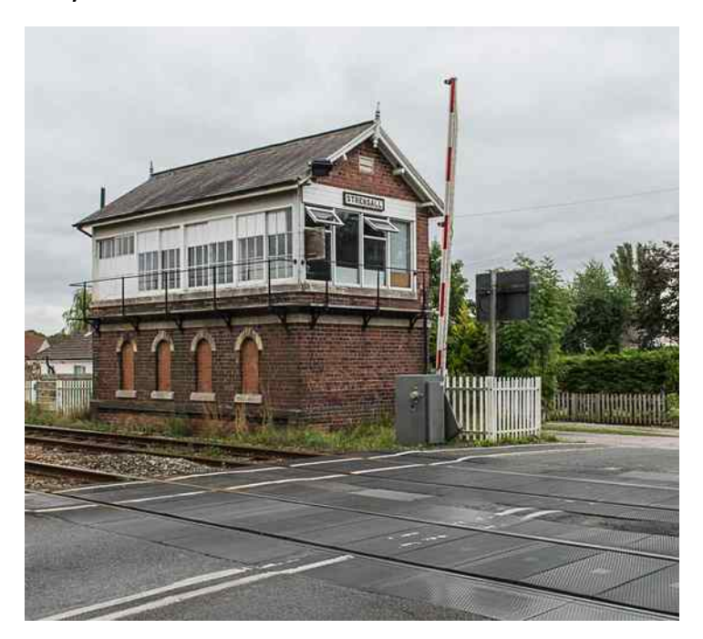
Strensall Signal Box

The east end of Strensall was developed from the mid-1840s as a result of the arrival of the railway in the Village. This was the first expansion of the Village outside its historic core. This Conservation Area was designated in 2001 as a result of action by the Parish Council. It was further expanded in 2011 following public consultation. It includes the former Station Yard and its storage facilities as well as 93-103 The Village, late 19th Century brick-built small terrace houses erected for both the railway workers and those employed at the local brickworks. The old Station House is a listed building, which forms a group with the Signal Box. This Signal Box is the last of its kind on the York-Scarborough railway line.