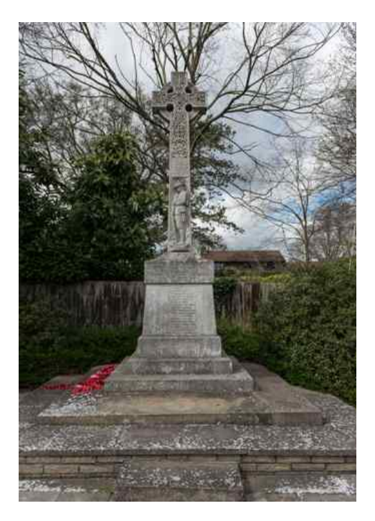
Strensall War Memorial