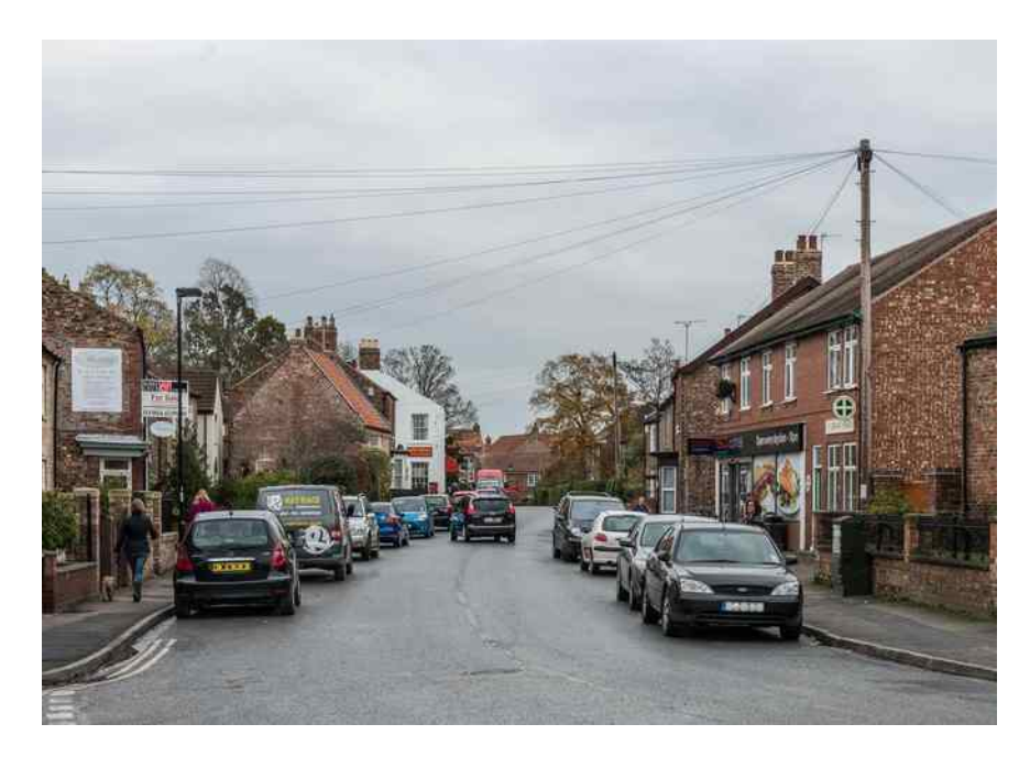
Shopping Traffic on The Village