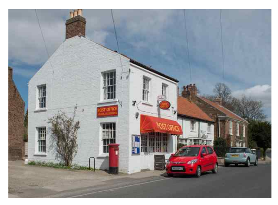
Strensall Post Office at the heart of the Village

generally felt that they provide good amenities for the size of the Village. The Post Office and the Library are, in particular, held in high regard and viewed as essential assets. However, the absence of a bank is viewed as a particular disadvantage, although the availability of Cash Machines at Cost Cutter and Londis is greatly appreciated.