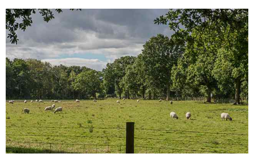
Oak Trees on Strensall Common

The majority of the TPOs cover oak trees. These trees must be safeguarded throughout their natural lifespan. Full details of the TPOs can be found on the City of York Council website.