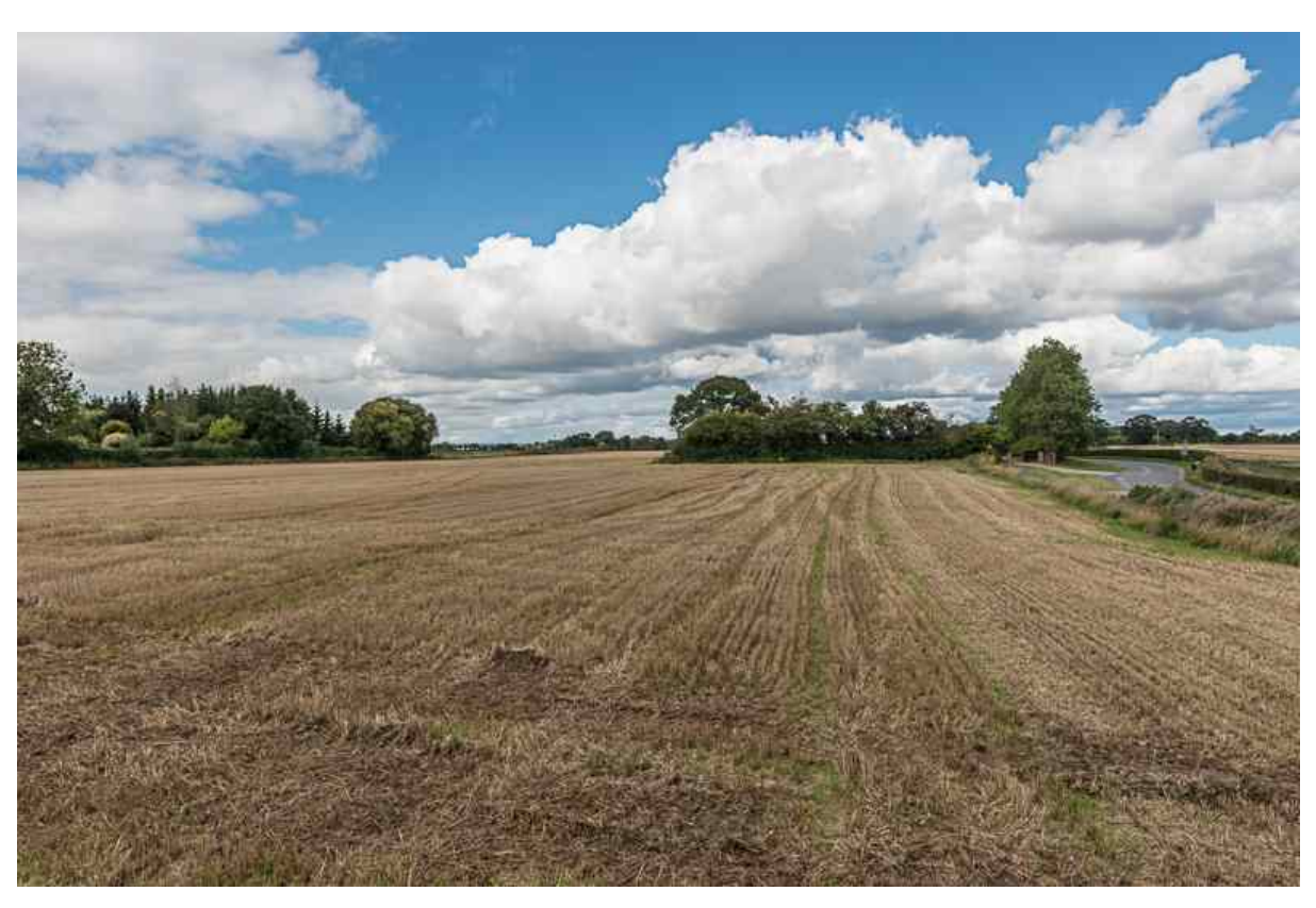
\label{looking towards Sheriff Hutton and Strensall Cemetery from New Lane. \\