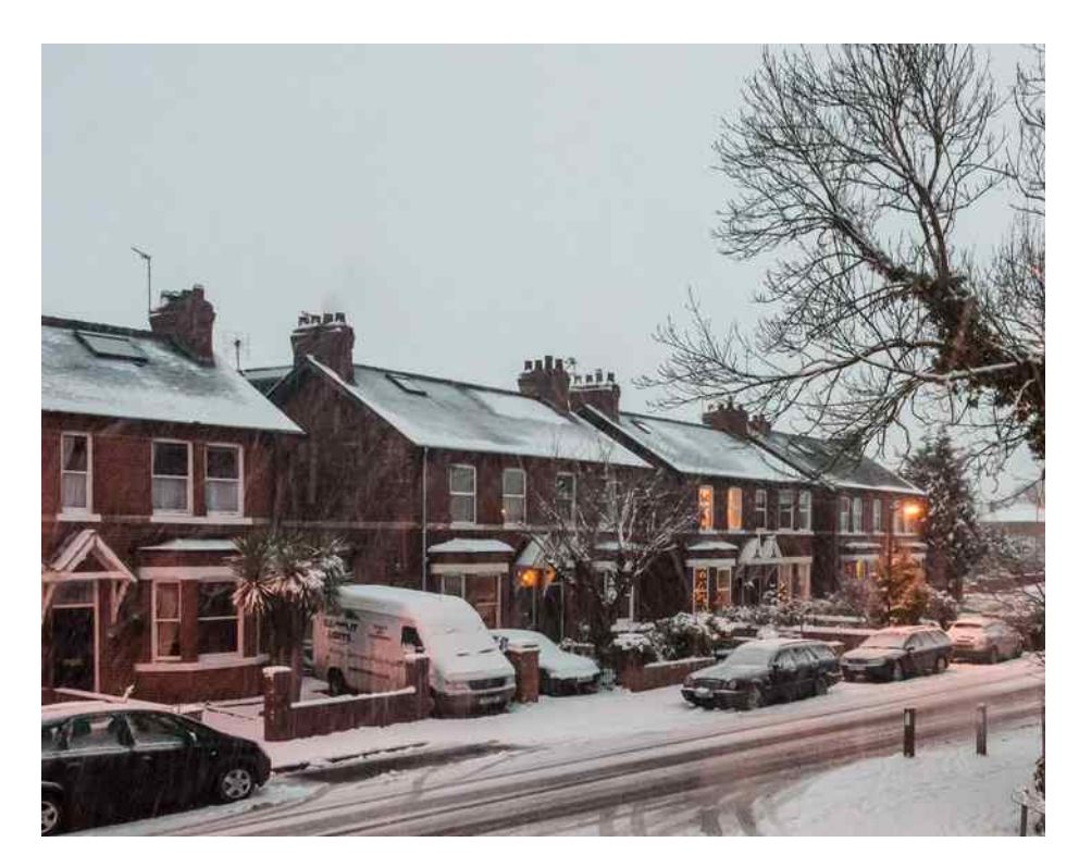
Former Railway Housing