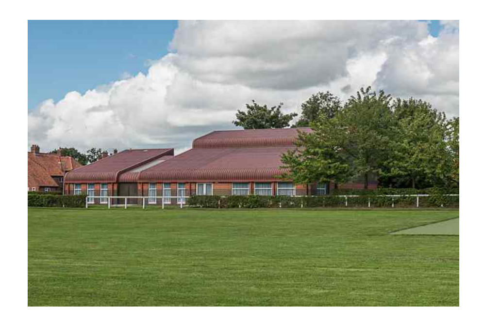
The Village Hall

With the roof leaking and the maintenance of the old building becoming more and more difficult, serious fund raising and grant hunting started in the Village and a new hall was built at Northfields at a cost of £279,000 in 1989. It included a badminton hall, meeting room, kitchen and other facilities and in 1990 won an award as the Ryedale Village Hall of the Year. Looking to the future, the hall was designed so it could be extended and the need for this soon arose. A new function room costing £60,000 was added and officially opened by the Lord Mayor of York in 1998.