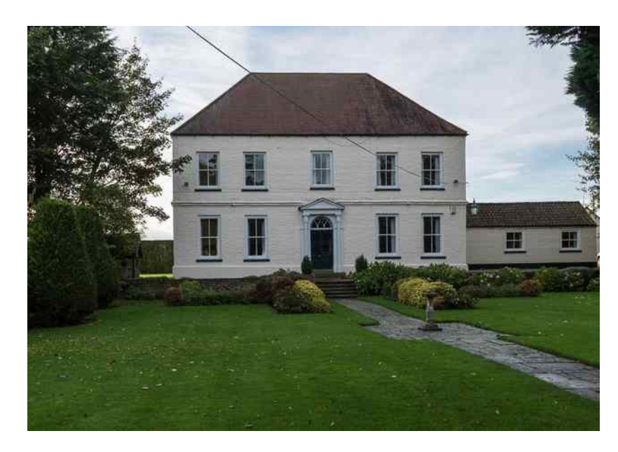
Manor House Farmhouse, Strensall