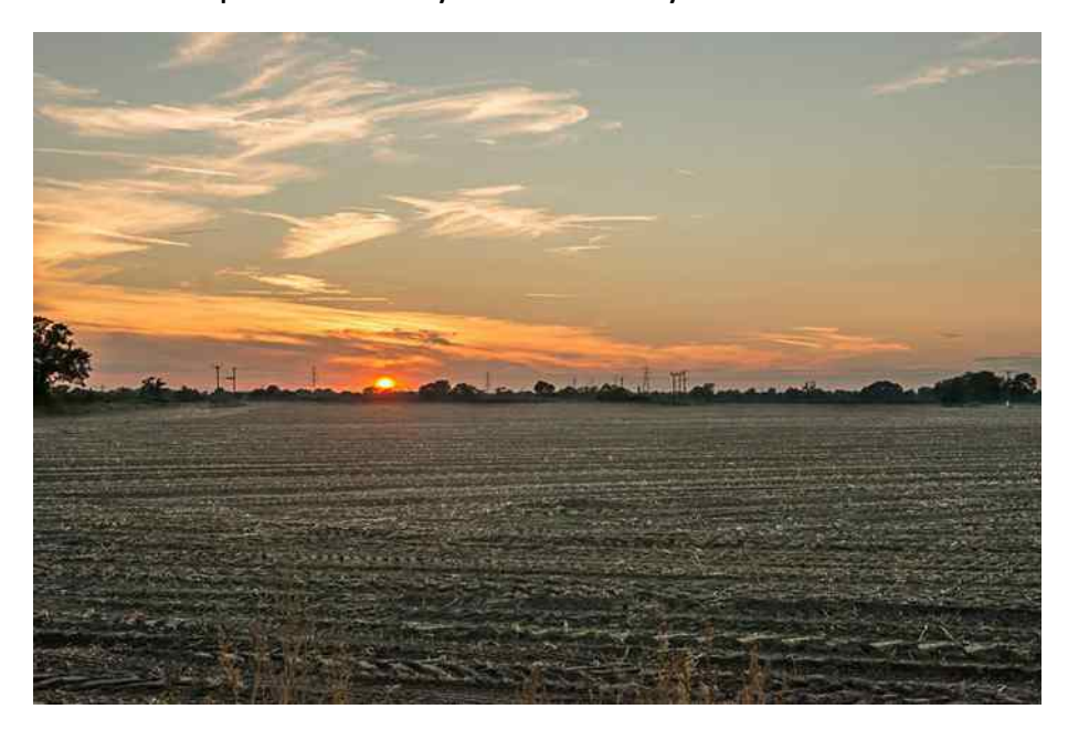
Looking West from York Road - Winter fields at Sunset.

The natural bottleneck within the Village is its centre, based around the junction with the Sheriff Hutton road. Traffic often grinds to a halt as through traffic competes with the bus service and shoppers' parking. In addition, the three level crossings and the roundabout at the junction of Ox Carr Lane and the York Road cause periodic delays on most days.